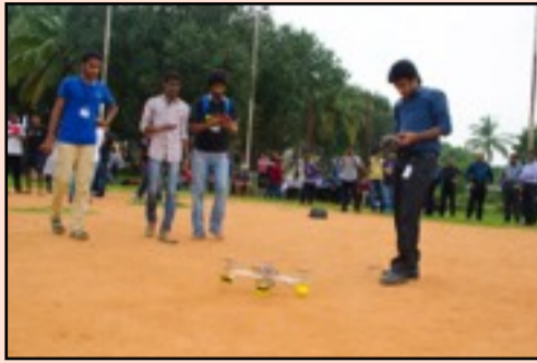
Participants on their way to fly their Quadcopter