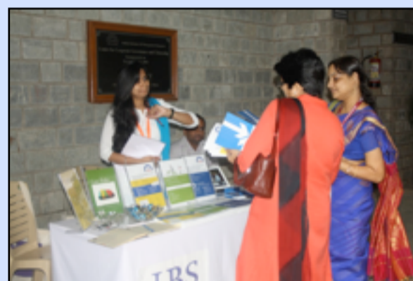
Conference participants at the IBS Hyderabad Exhibition Stand at 'The Case Centre Anniversary Conference'

IBS-CRC exhibited its award winning cases, best selling cases and upcoming events. The stall received enthusiastic response from the participants.