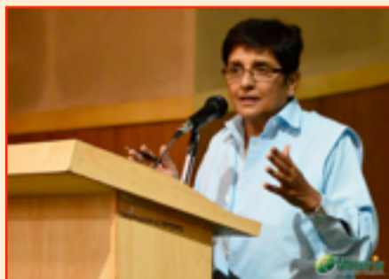
Kiran Bedi addressing the IFHE faculty and students