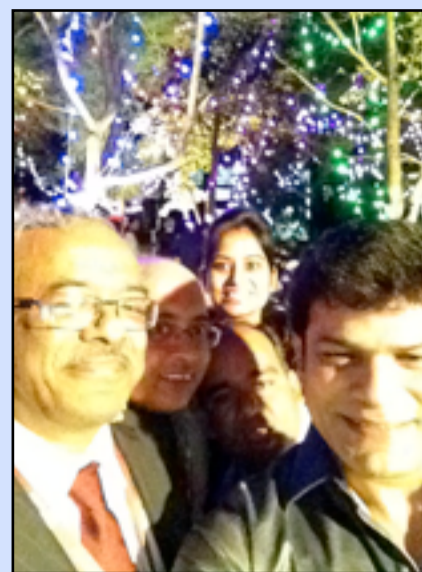
IBS Team's award winning group selfie

The IBS Team also won the selfie contest '#caseconf14' at the conference