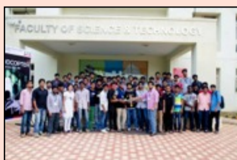
Quadcopter flying high at IFHE Campus during workshop Photo session at Closing ceremony