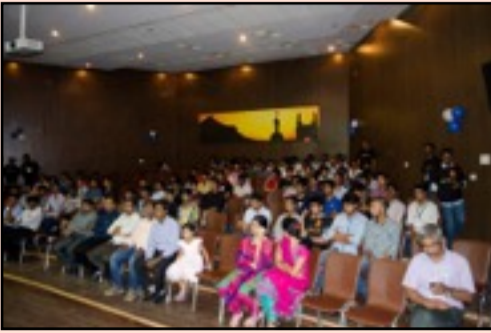
Inauguration of Quadcopter Workshop

It was the biggest technical event in South India for 2014 organised by the ECE Department. 190 students from FST and other colleges had participated in the workshop. Cash prize of Rs 10,000/- and participation certificates were presented to the participants.