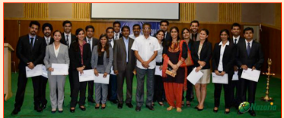
BEST SIP Awardees

SIP Awards 2014 were presented to 18 students and certificates were presented to their faculty guides on the occasion of Teachers Day.