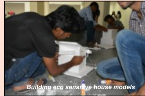
Building eco sensitive house models