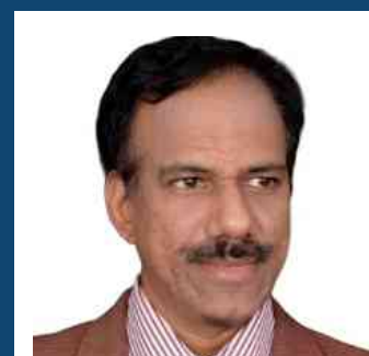
Dr. Sriram Birudavolu CEO, Cyber Security Center of Excellence Data Security Council of India