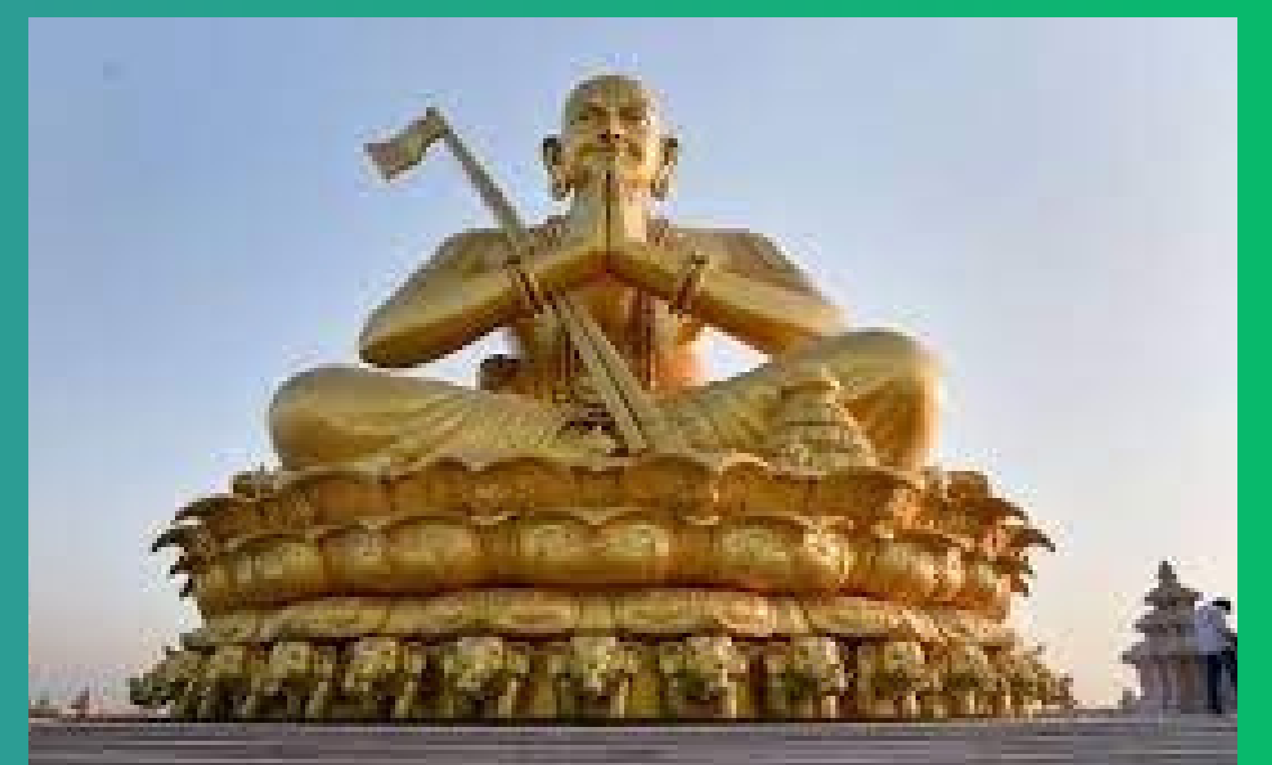
Statue of Equality