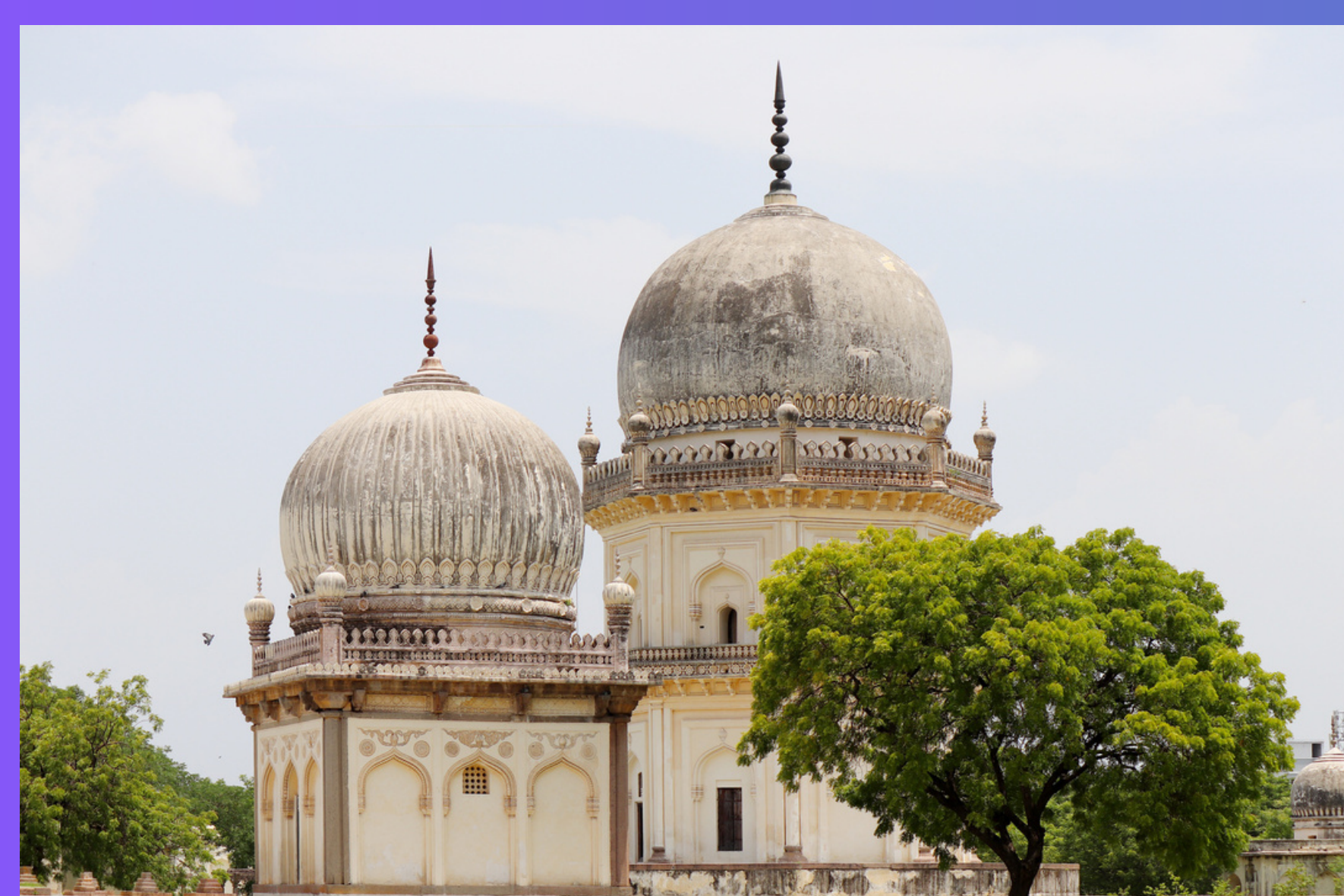
Qutb Shahi Tombs