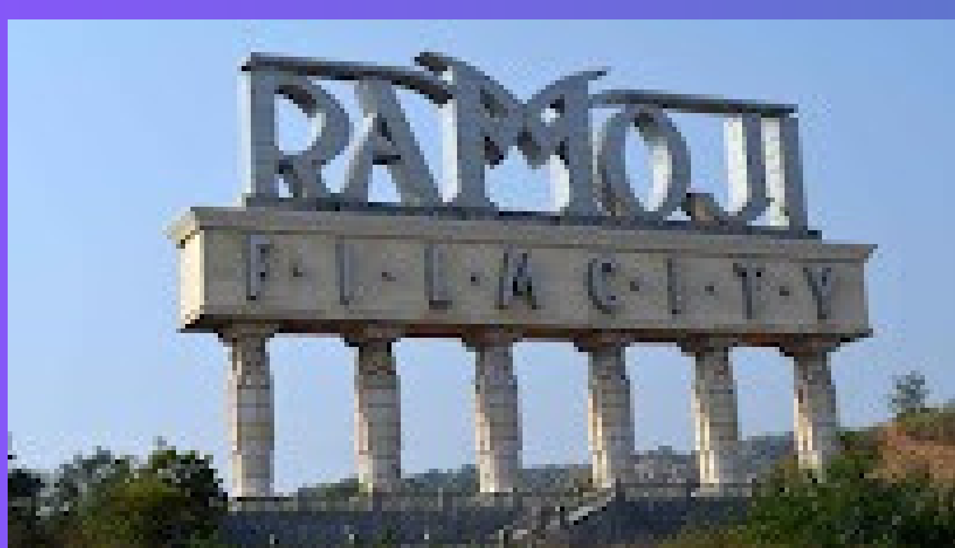
Ramoji Film City