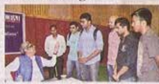
Prof. Bibek Debroy interacting with students at ICFAI University.