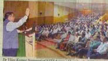
Dr Vijay Kumar Saraswat of NITI Aayog addressing the students.

grading to the latest technology and innovating new things which can be useful for the nation at large. "Abstract research is of no use and it should be completely avoided," he said. He urged the students to Think big... and Think creatively to outperform the competitors.