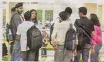
Icfai offers a stipend of about ₹25,000 as a fellowship and also induces scholars as faculty after successful completion of their programme.

To promote research, the university is providing financial incentives of up to ₹1 lakh for faculty who publish their research papers in international and national peer reviewed journals. "We also en-