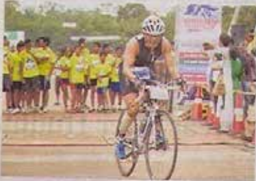
A participant at the 6th edition of the Triathlon in the city on Sunday.

The Triathlon involved swimming, cycling and running and a mini version of the event was also held for children aged five and above. The three-fourth iron, considered the toughest event, had professional athletes swimming 2.9 km and cycling 135 km and finally running 33 km.