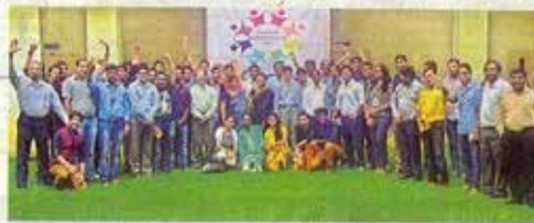
A group photograph of the alumni reunion, 'Continuum' at ICFAI campus, Shankarpally, Hyderabad