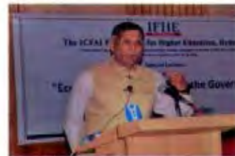
The ICFEAI address ICFEAI students about governance during a seminar at the Government.

The ICFEAI Foundation for Higher Education (IFHE) organised a seminar on 'Institutional Policy Making in the Government' for senior bureaucrats, Chief Economic Advisor, Government of India, Prof. Arvind Subramanian on Friday, Nov 13, at ICFEAI Law School, Hyderabad.