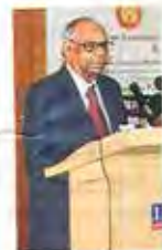
Former RBI Governor C. Rangarajan