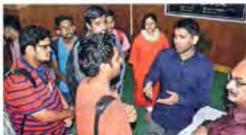
Students attending the lecture on Big Data and Artificial Intelligence.

The lecture was organised by the ICFEAI Foundation for Higher Education (IFHE) in collaboration with the Government of India.