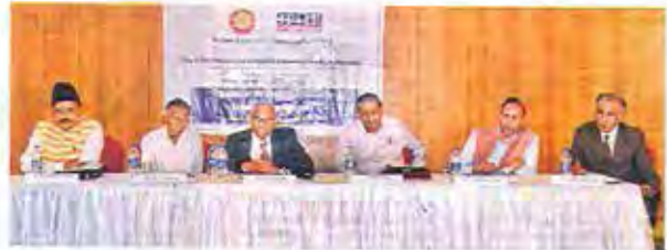
Dr. C. Rangarajan speaks in the panel discussion on Quality of the Doctoral Programme at ICAI University.