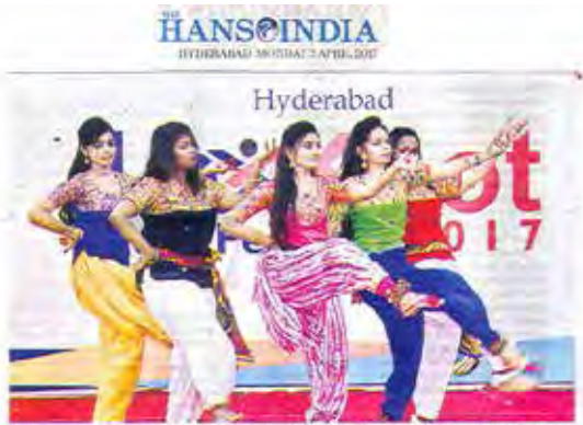
Students performing at the Lex Knot, a law festival conducted by the ICFAL Law School at ICFAL University Campus, Domsapally, Hyderabad