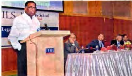
Justice Chelameswar speaking at the seminar organised by ICFEAI.

Justice Chelameswar, Judge, Supreme Court of India said the legal education system has witnessed a paradigm shift. Speaking at a one-day seminar on 'Legal Education and Profession - A Convergence today' at ICFEAI University here, Justice Chelameswar said advancement of technology has proven that the need to have a photographic memory to make a good lawyer has become redundant. He highlighted that present legal education system and its adequacy to train students to bring out the proposition of law to the facts is to be constantly achieved by the law schools to meet the emerging challenges of the legal system. He further stated that legal education should be designed in such a way that students are trained in areas which are detachable and new like environmental law, Intellectual Property Rights etc., starting the needs of the legal system. The Supreme Court judge mentioned that there were discrepancies in the qualitative and teaching methods across various