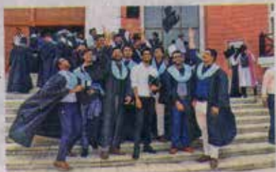
Students celebrate after receiving degrees during 8th convocation ceremony of ICAFI Foundation, Hyderabad on Thursday.