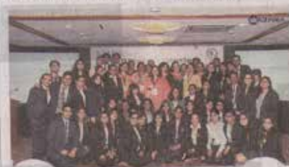
Participants at the CEO Women Conclave, which was conducted by the Centre for Women Development, a constituent of ICFAT Foundation for Higher Education, Hyderabad, to highlight achievements of women.

Centre for Women Development (CWD), a constituent of ICFAT Foundation for Higher Education (IFHE), Hyderabad, conducted the CEO Women Conclave that showcased talks showcasing contemporary aspects highlighting achievements of women.