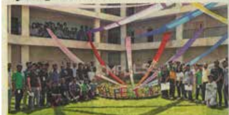
Students at Impulse TechFest at IcfaiTech in Hyderabad

IcfaiTech, Faculty of Science & Technology of the ICFAI Foundation for Higher Education, organised a three-day national-level technical symposium "Impulse 2019".