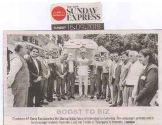
IT Minister BVR Mohan Reddy launches the Startup India India Fest in Hyderabad on Saturday. The campaign's primary aim is to encourage students from IITs and IISc to start businesses in Hyderabad.