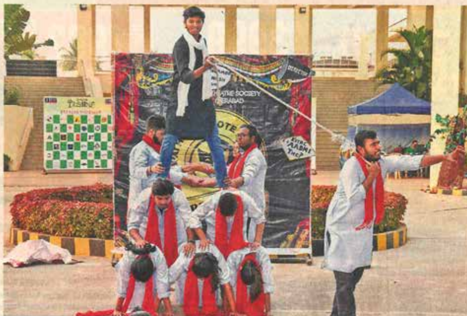
A street play being performed on green revolution on Tuesday.

Students from different parts of the country participated in about 40 events