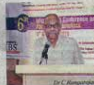
Dr. C. Rangarajan

In his inaugural address, Dr. Rangarajan, Chancellor of the ICFAI Foundation for Higher Education, Hyderabad, a deemed-to-be University, highlighted the relevance of econometrics as an applied discipline, to governments & businesses. Describing it as a confluence of mathematics, economics & statistics, he traced its rapid progress since the World War II - it owing to the challenges of economic policy. Theoretical postulates, according to him, gain universal