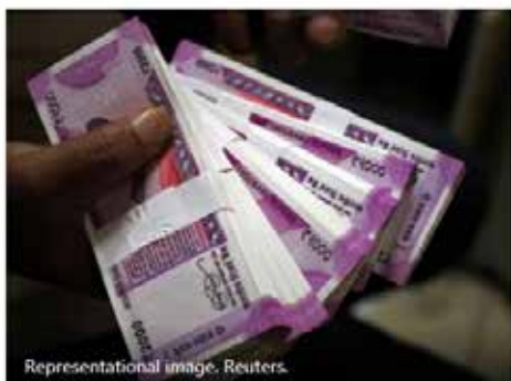
Representational image.

He was speaking at the inaugural session of a three-day international conference on 'Insolvency and Bankruptcy Laws: Global Response' organised by ICFAI Law School, in association with Delaware Law School, Widener University and Insolvency and Bankruptcy Board of India.