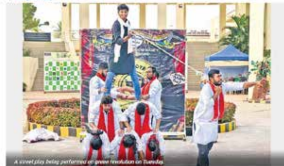
A street play being performed on green revolution on Tuesday.

By Telangana Today | Published: 23rd Jan 2019 | 1:38 pm