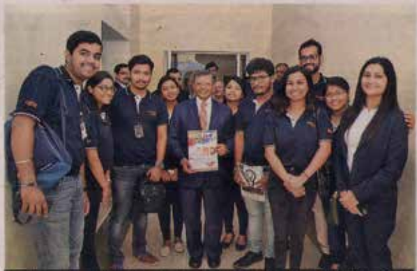
Emory University Goizueta Business School Visiting Professor Prof. Jagdish Sheth with students of ICFAI Business School.