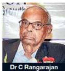
Dr C Rangarajan

future," he added. Dr C Rangarajan, Chancellor of the University, who presided over the function said that better education developed responsible citizens, who in turn help in nation building. Emphasising on the three dimensions of education — access, equality and quality, he added, "A teacher will simply convey; a good teacher will communicate, but, a great teacher will in-