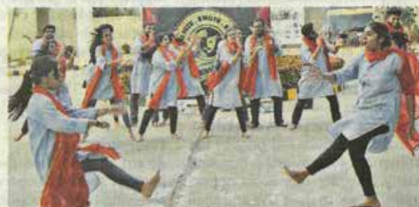
Students of ICFAI Business School present a skit as part of their cultural festival, Trishna.

Students of ICFAI Business School, Hyderabad, launched an awareness campaign by taking up 'Green Revolution and Go Green' as the theme for their college fest, Trishna.