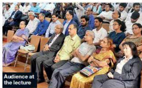
Audience at the lecture

future," he added. Dr C Rangarajan, Chancellor of the University, who presided over the function said that better education developed responsible citizens, who in turn help in nation building. Emphasising on the three dimensions of education — access, equality and quality, he added, "A teacher will simply convey; a good teacher will communicate, but, a great teacher will in-