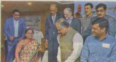
Telangana State Innovation Cell members during the launch of the campaign of the Start-up India Telangana Yatra on Saturday.