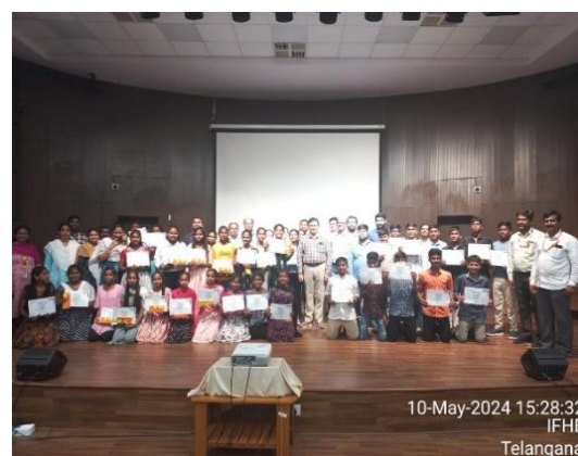
Summer camp Photos