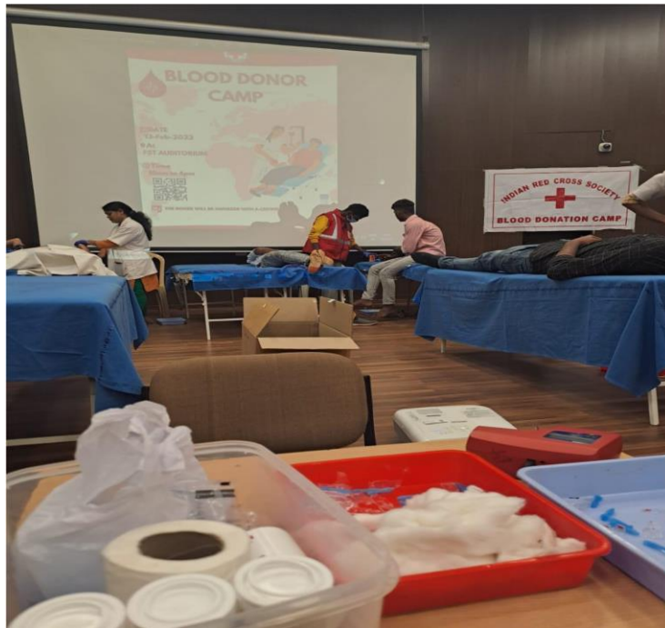
Nurses and professionals taking their diagnosis