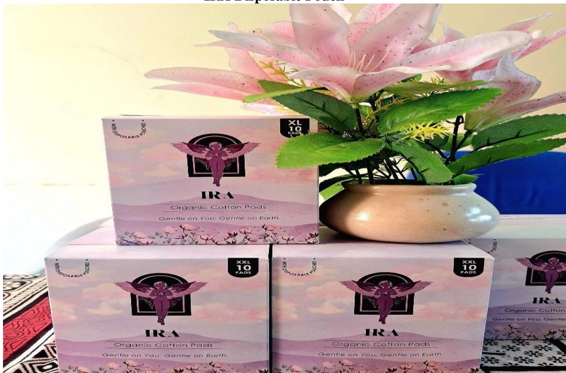
IRA Disposable Pouch