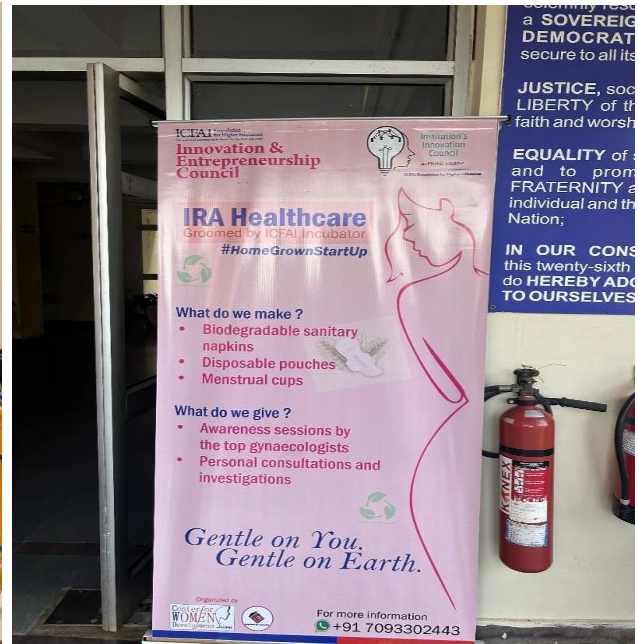
IRA Healthcare Groomed by ICFAI Incubator