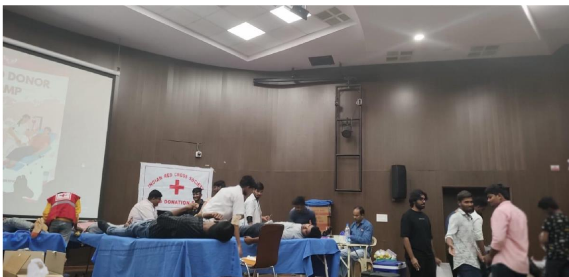
The volunteers taking part in the event

The event took place successfully in the FST Auditorium on 13th February 2023, Monday.