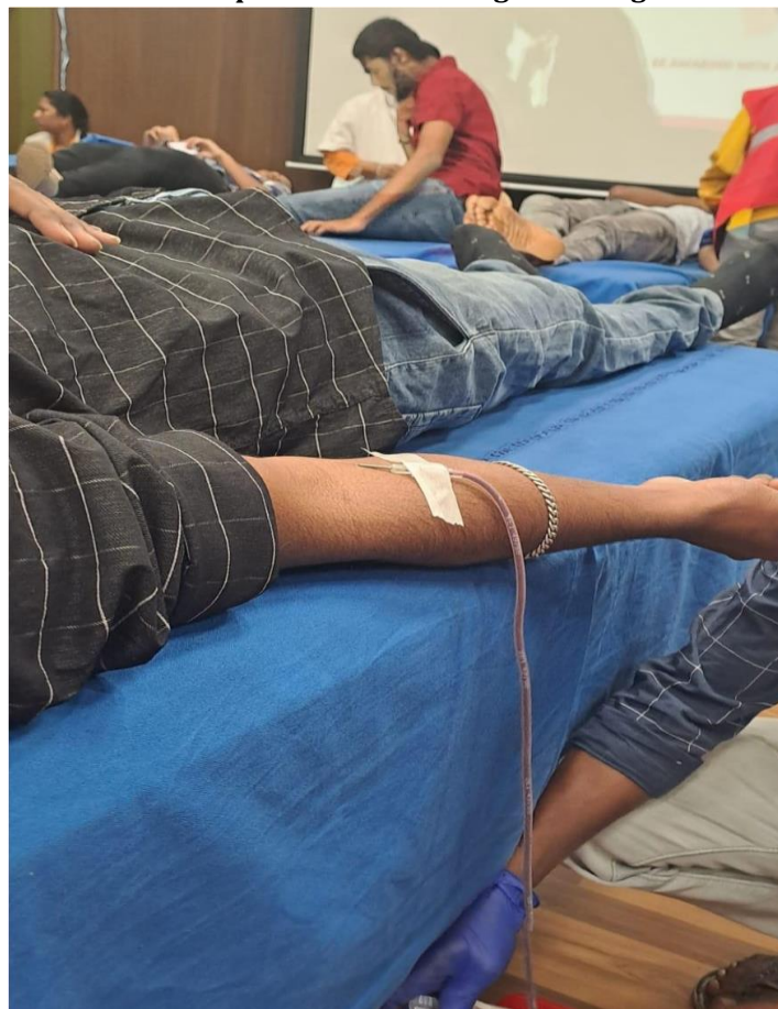
A student taking part in the event