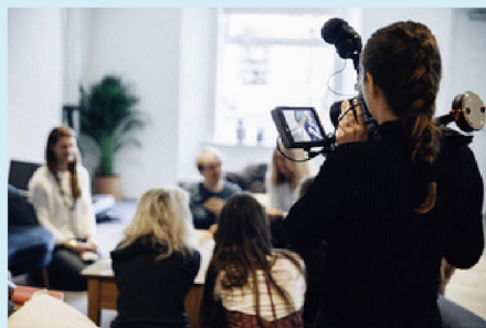
International Press (IP)