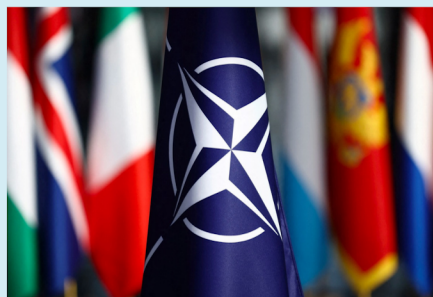
North Atlantic Treaty Organization (NATO)