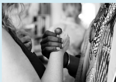
United Nations Human Rights Council (UNHRC)