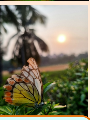
Cash Prize For The Winners: