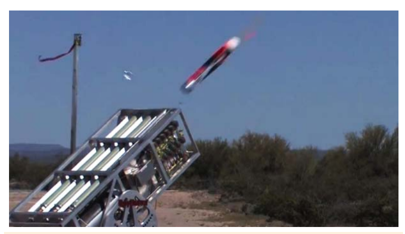
Fig 2: US Navy LOCUST Tubular Autonomous Swarming UAV