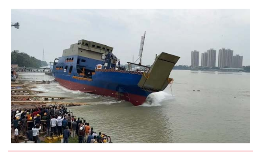
FIGURE 2 SIDE LAUNCH OF MONO HULLED (SINGLE HULL) PASSENGER CUM CARGO FERRY, MV MA LISHA, AT TITAGARH RAIL SYSTEMS LIMITED ON THE BANKS OF HOOGHLY RIVER. THE HEEL (TILT) OF THE SHIP POST LAUNCH IS EXPECTED AND A RIGHTING MOMENT CREATED AS A RESULT OF BUOAYNCY FORCE ACTING UPWARDS BRINGS THE SHIP BACK TO ITS UPRIGHT POSITION IN ORDER TO ATTAIN EQUILIBRIUM.