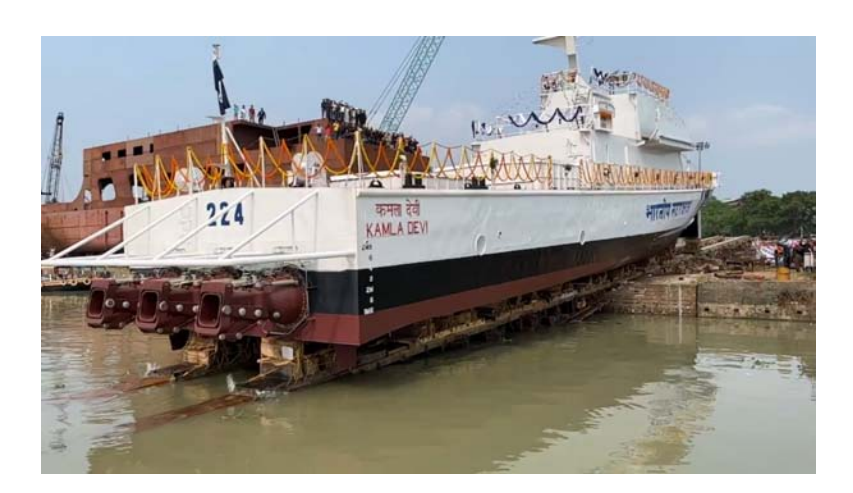
FIGURE 1 END LAUNCH OF FAST PATROL VESSEL, ICGS KAMALA DEVI, AT TITAGARH RAIL SYSTEMS LIMITED (KOLKATA) ON THE BANKS OF HOOGHLY RIVER. THE SLIPWAYS CAN BE SEEN BELOW THE SHIP.

In the realm of shipbuilding, gravitational launching, which includes both end and side launches, stands as a hallmark to traditional methodologies, harnessing gravity's pull to guide ships from construction to the sea. This technique is executed on slipways - inclined structures that lead directly to the water, serving as the launching pad for the vessel. During an end launch, the ship is oriented lengthwise along the slipway, with its stern (rear) or bow (front) facing the water. As gravity takes over, the vessel accelerates down the slipway, gracefully entering the water end-first. This method is typically employed in shipyards with adequate space and a suitable layout, allowing for a straightforward launch trajectory. Side launches, on the other hand,