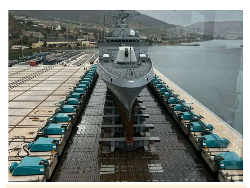
FIGURE 9 EXAMPLE OF A SYNCROLIFT

An interesting alternative to conventional dry docks which require huge space on land are floating dry docks. Sometimes, a ship is built on land and then moved to a floating dock for launch. This setup resembles a ship lift, with rails that help transfer the completed ship onto the dock. Then, the dock can either be submerged right there or towed to deeper waters to let the ship float away. Another method involves using a pontoon, similar to how offshore structures are moved. Pontoons need extra buoyancy to stay stable during this process, typically provided by towers at each corner. This kind of pontoon,