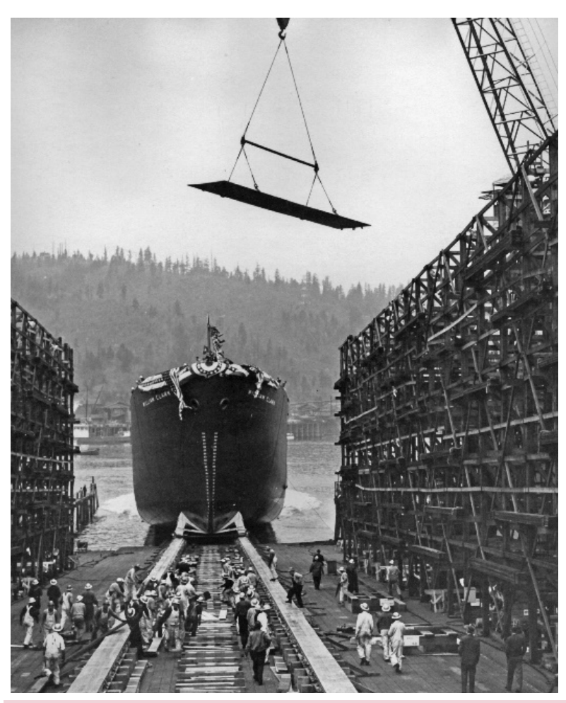
FIGURE 10 LAUNCH OF US CARGO SHIP, SS WILLIAM CLARK, USING RAILS IN 1942